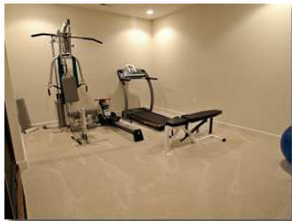
Media or Exercise Room