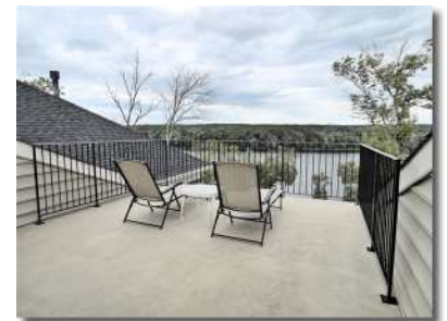
Roof Deck—14' X 19'