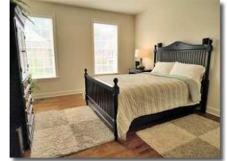
Bedroom #5 (Upper Level 1)