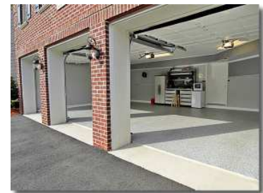
Fully finished 3-car Garage with Work Bench and Non-Slip Flooring