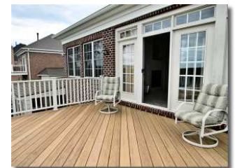
Master Suite's Private Deck