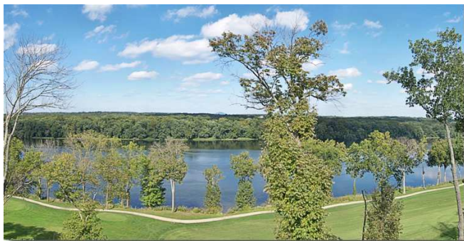
View from the Roof Deck