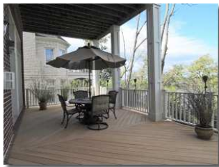
Main Level Deck