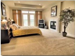
Luxurious Master Suite