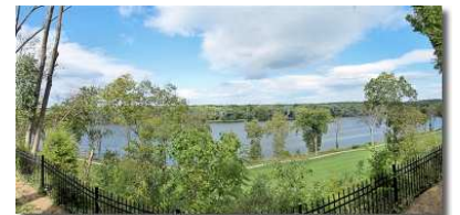
View from the Main Level Deck