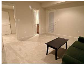
Bedroom #6 with Full Bath