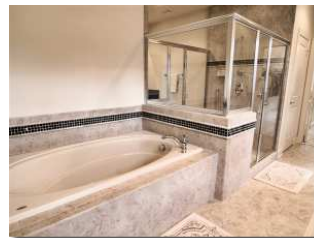
Salon Master Bath