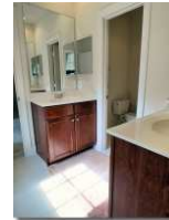
Jack 'n Jill Bath