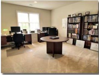
Bedroom #2 (2nd Master Bedroom)