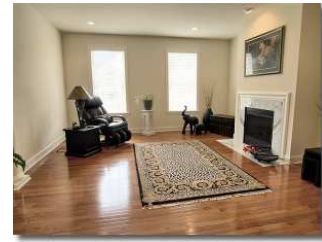
Library (Upper Level1)